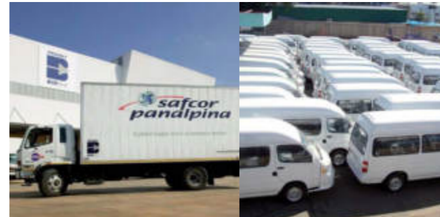
state-of-the-art logistics facility